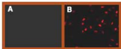
Immunofluorescence staining of HA-tag fusion protein (transcription factor) in a stable expressing cell line (B) and control cell line (A).